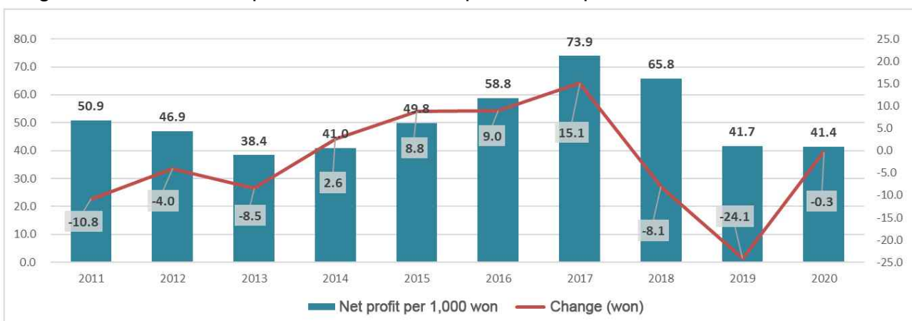
<Figure> Trend in net profit before the corporate tax per 1,000 won of annual sales

□ Among survey target enterprises, 5,823 enterprises operated subsidiaries. Among them, 3,313 enterprises operated subsidiaries overseas, which rose by 2.0% from 3,247 enterprises in 2019.