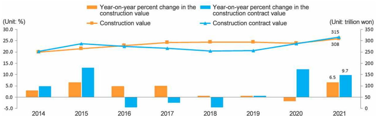
< Trends in construction value and construction contract value >